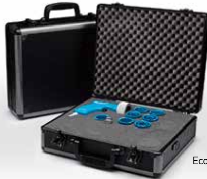
Economy Hose Cleaning Kit