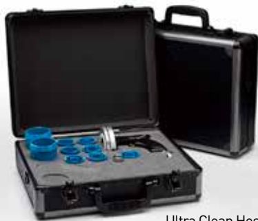
Ultra Clean Hose Cleaning Kit

Along with the pellet flushing system, Parker offers an innovative capping system. Clean Seal is a quick, easy, and clean alternative to cap your hose and fitting assemblies. This reduces contamination, capping time, and cap inventory as one cap may fit many different end configurations and sizes. Simply place the cap on the end of your hose or fitting, place in the Clean Seal System for a few seconds, and remove. The caps enable a secure fit due to the heat shrink technology. Caps can just as easily be removed by pulling the tab that sticks up once heated.